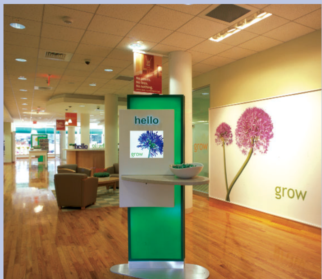
Citizens new Belmont, Massachusetts branch

Out of that feedback came a plan to pilot a branch office design that would reflect Citizens' declared brand attributes—defined by adjectives such as respectful, fair, warm, and appreciative. The bank stuck to a core brand-building principle by setting realistic goals for implementation. The right new design could improve customer satisfaction and employee satisfaction, the latter factor being crucial if face-to-face encounters were to fully support the bank's brand attributes. It would also yield a repeatable prototype.